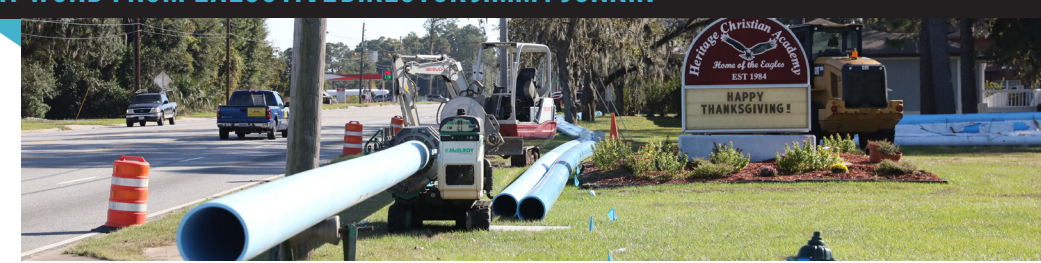
Water pipe is prepared for installation along New Jesup Hwy in November. This water system expansion was funded by Friendly Express to accommodate the needs of their new location at the corner of Hwy 341 and Community Road.